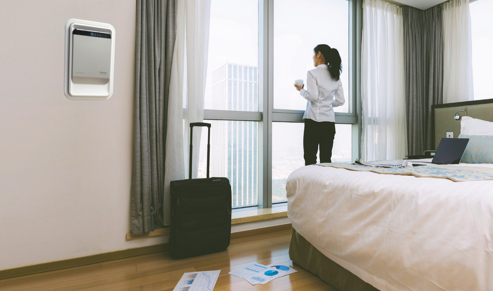
AM2 is shown recessed, making it ADA compliant