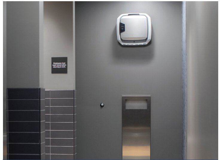
Wall Mount for maximum productivity

AeraMax Pro was designed to seamlessly integrate into your space, whether on the floor, wall-mounted or recessed into the wall. All models are unobtrusive and aesthetically pleasing, so you can provide worry-free air purification wherever it's needed the most.