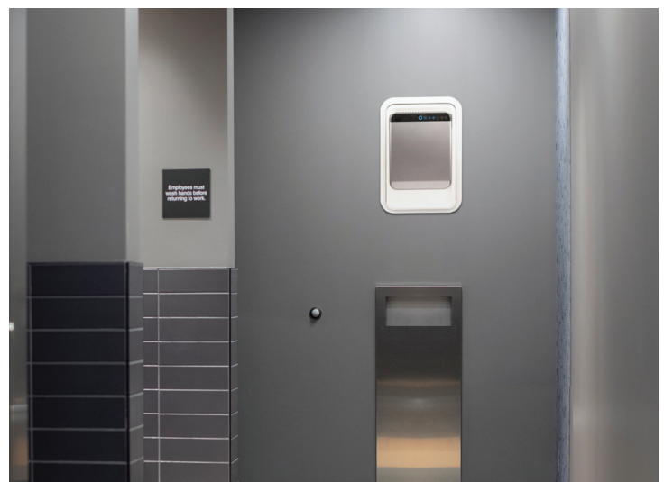
Recessed for ADA compliance