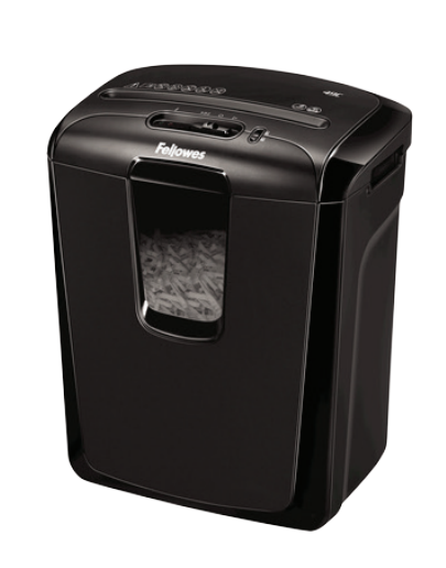
POWERSHRED® 49C Cross-Cut Shredder

The risks of identity theft remain even when you work remotely. If you're managing confidential documents from your home office, be sure to follow your company's document destruction policy. Cross cut and micro cut paper shredders provide the highest levels of security. Find one that fits your home office.