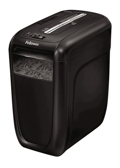
POWERSHRED® 60Cs Cross-Cut Shredder 4606001