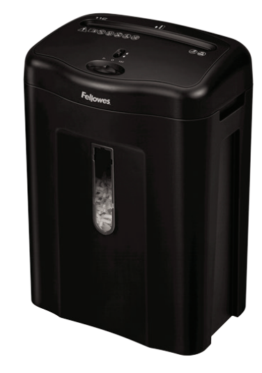
POWERSHRED® 11C Cross-Cut Shredder