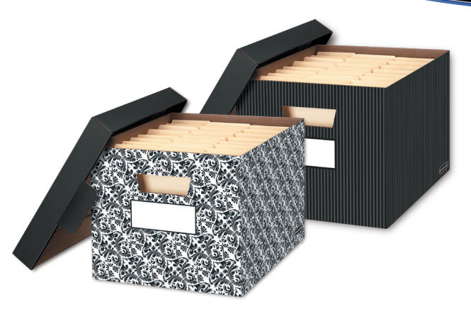
STOR/FILE™ STORAGE BOXES