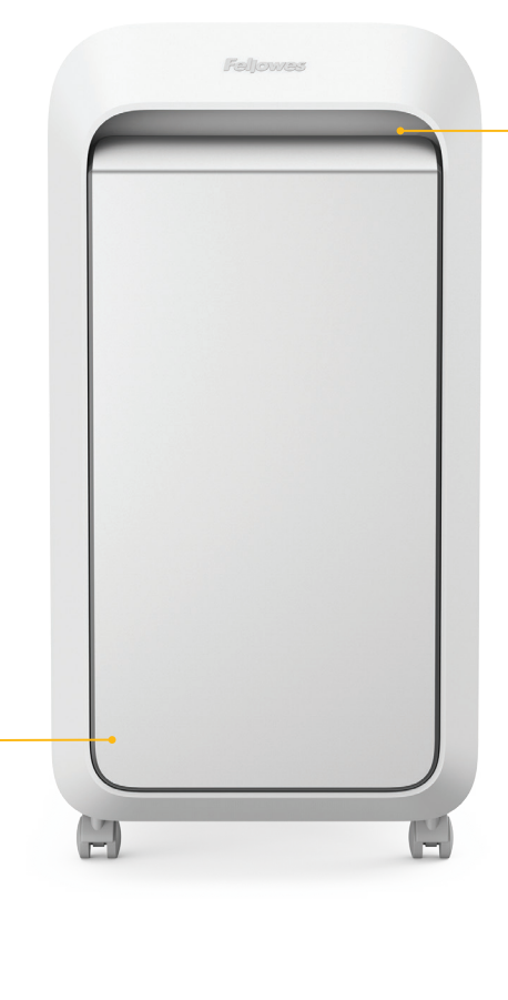
Convenient pull-out bin