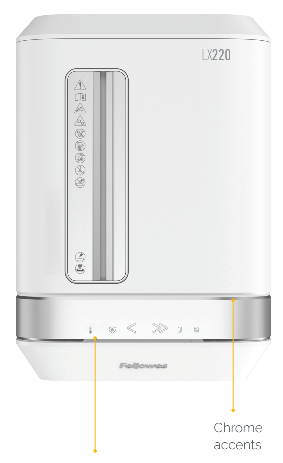
Feature communication simplified all in one spot

Two-piece front & back design eliminates harsh parting lines