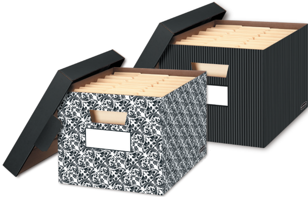
STOR/FILE™ STORAGE BOXES